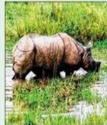
A rhino in Kaziranga National Park